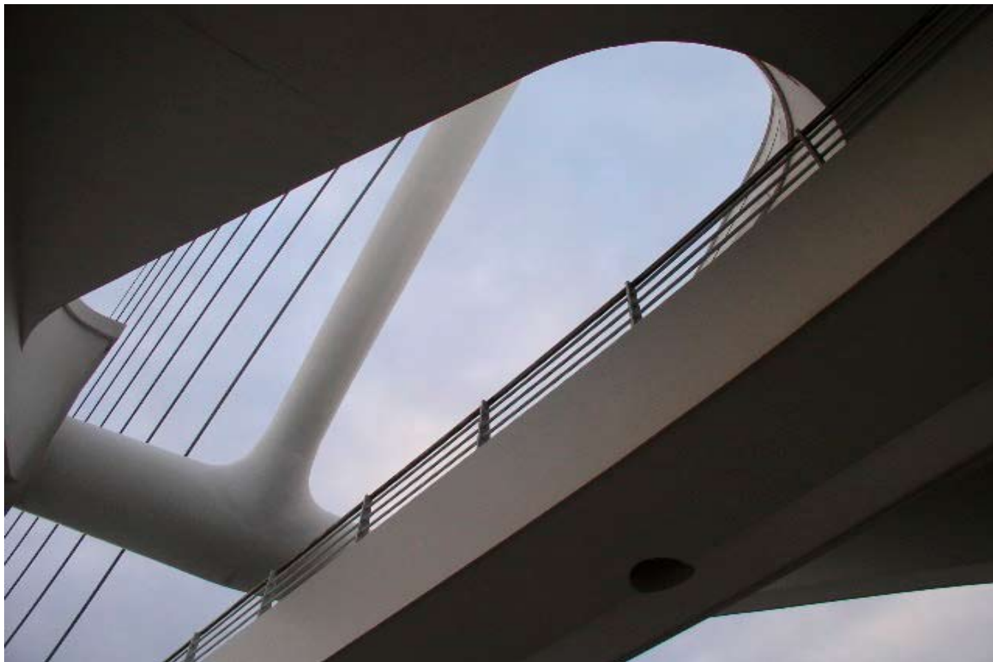
Milwaukee Art Museum

Highlights for me this year were the Bachelor of Design and the BAA (Illustration) both of which were mounted in Toronto respectively in the Distillery district and the Steam Whistle Brewery. The work was terrific, well displayed, and there were large crowds in attendance. Another highlight for me was the awards evening for the Music Theatre and Theatre Technical Production programs. The recognition of student achievement was punctuated by very special presentations from the Music Theatre repertoire. I was able to drop in on one of the nights of the Media Arts screening (again, I saw excellent work) and I was able to attend the opening of the Advanced Television and Film presentation. I got a chance at the Journalism - New Media evening to hear directly from industry representatives about the kind of career path our graduates might follow. Of course, the opening of the addition to A-wing and the Animation industry screening was a great success with many of the industry reps commenting on the high level of work in the student films. That applied to the Computer Animation screening as well, which took place on the same day. The displays at Open House were impressive as usual. These were happening along with a student