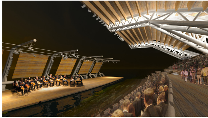
Interior Design alumna Lila Yavai's 'Water Theatre' uses water as a reflective material for sound.

School Meeting Tuesday, November 24, 2009